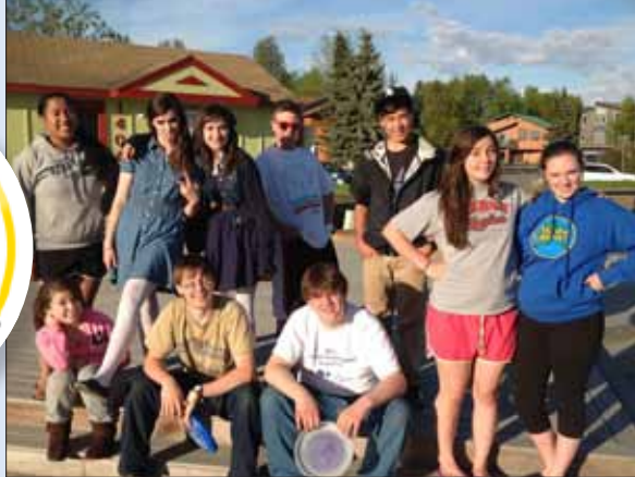
Diocese of Juneau teens travel to ACYC in Anchorage.