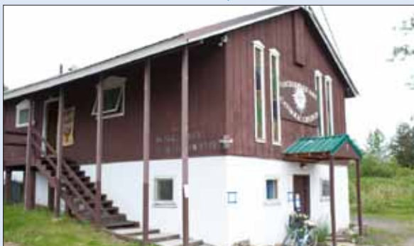
Sacred Heart chapel, Hoonah

The climate of Southeast Alaska is harsh on our aging churches and facilities, many of which do not have adequate parish resources to perform basic maintenance needs. The Diocese continues to address critical maintenance procedures in the missions, and to support reconstruction and repair in our parishes. The Cathedral in Juneau is in need of renovation for safety and accessibility.